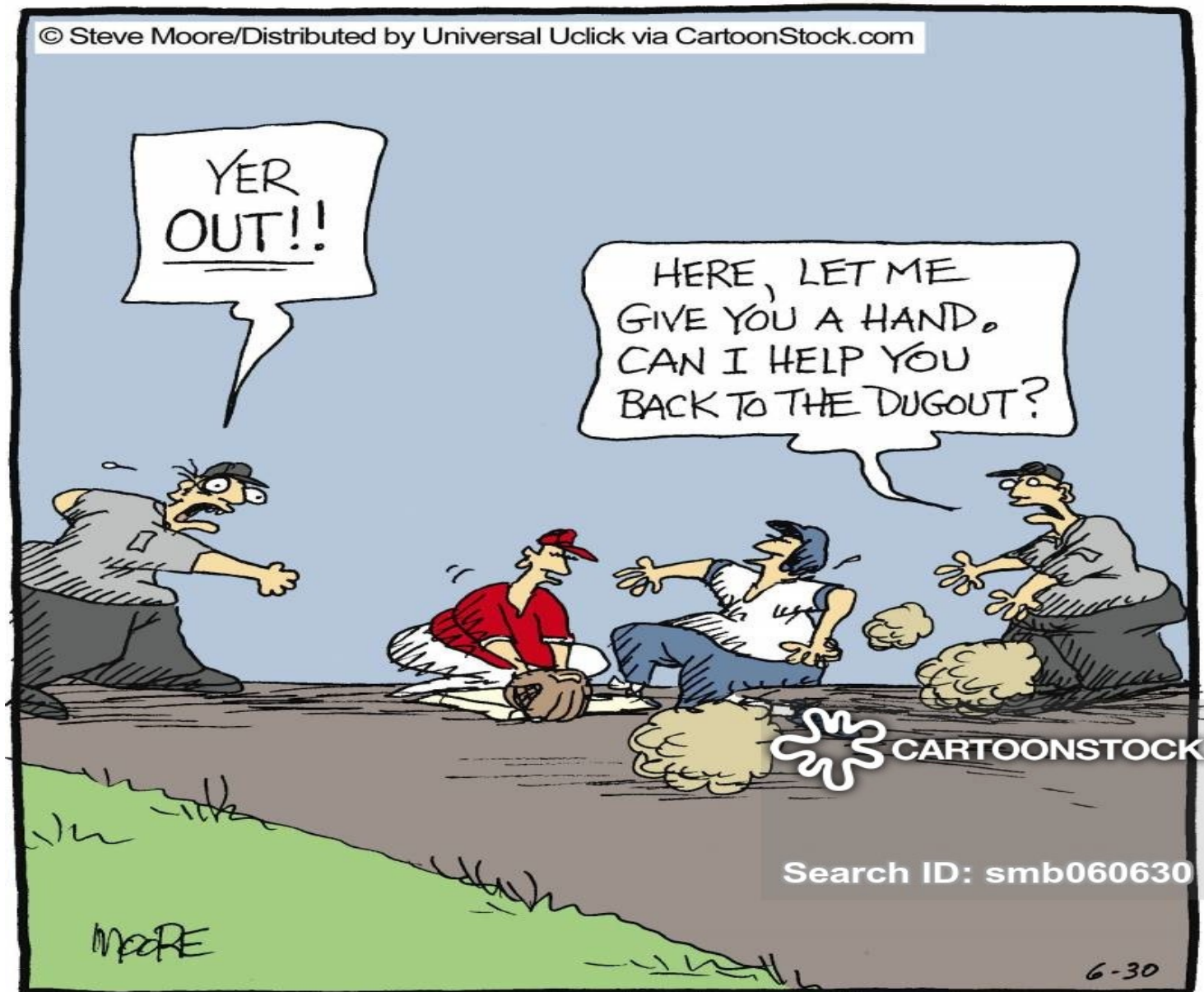
The old “good ump, bad ump” ploy.

We invite you all to check out the new front page on our BCBUA Website. The site is being enhanced to include a bunch of new features, including more relevant information for instructors. There will also be an upgraded look and feel. Check it out. We're still at www.bcbua.ca