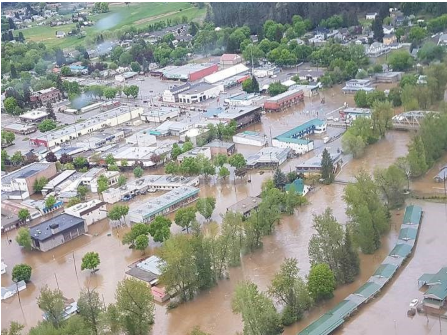
An aerial view above downtown Grand Forks where flooding was the worst in the history of the town