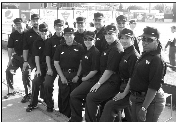
International Umpire Crew IBAF Women's World Championship Edmonton 2012

along with some other items for discretionary gifting. The Cuban umpires were very excited to receive these things from us. I also collected and was given many baseballs, gloves and assorted baseball equipment for youth, and baseball cards. Being able to give this equipment away to kids who would never see such things rivaled my best experience there on the field. There would be kids – young and old – playing scrub in fields...parking lots or even the streets outside the stadiums, but between a dozen or more of them they might have one ratty old glove and a stringy baseball. On one occasion after one of our games, I walked up to a 15 year old boy playing with friends in the street and handed him a good quality Mizuno fielder's glove with a brand new baseball in it. I was not prepared for the reaction I got. The game stopped because he was yelling...and all the kids came running over to see...then they shouted out dibs on who would be next to use it...after passing it around of course and checking it out. They immediately used the new ball, but were very careful not to let it hit the ground and scuff it. I thought they were going to hoist me in the air they were so grateful. This was just ONE of the instances I had...I would have to say it was most humbling to return home and know how much we have that we take for granted after that experience.