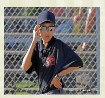
Clinics are Cool!

annual umpire clinic, be sure to check out our webpage at